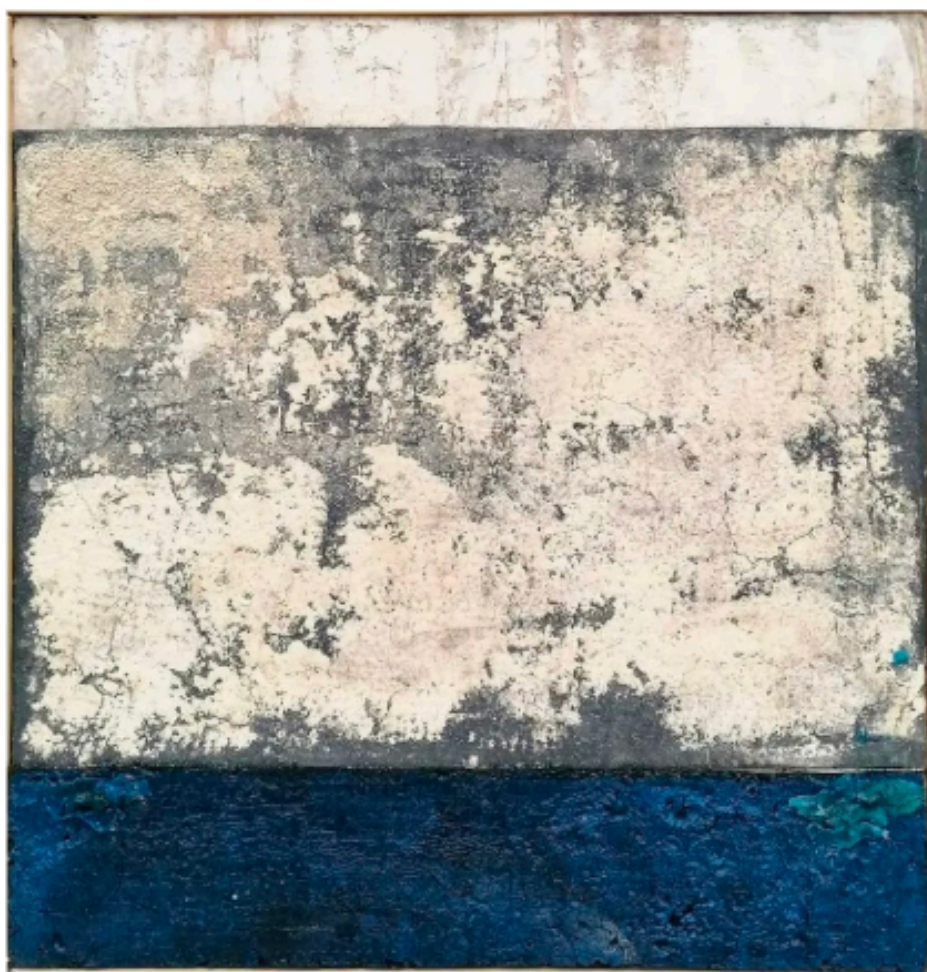
Madre grande anima , Wood, paper, felt, tar and biolime base, 39x40 cm