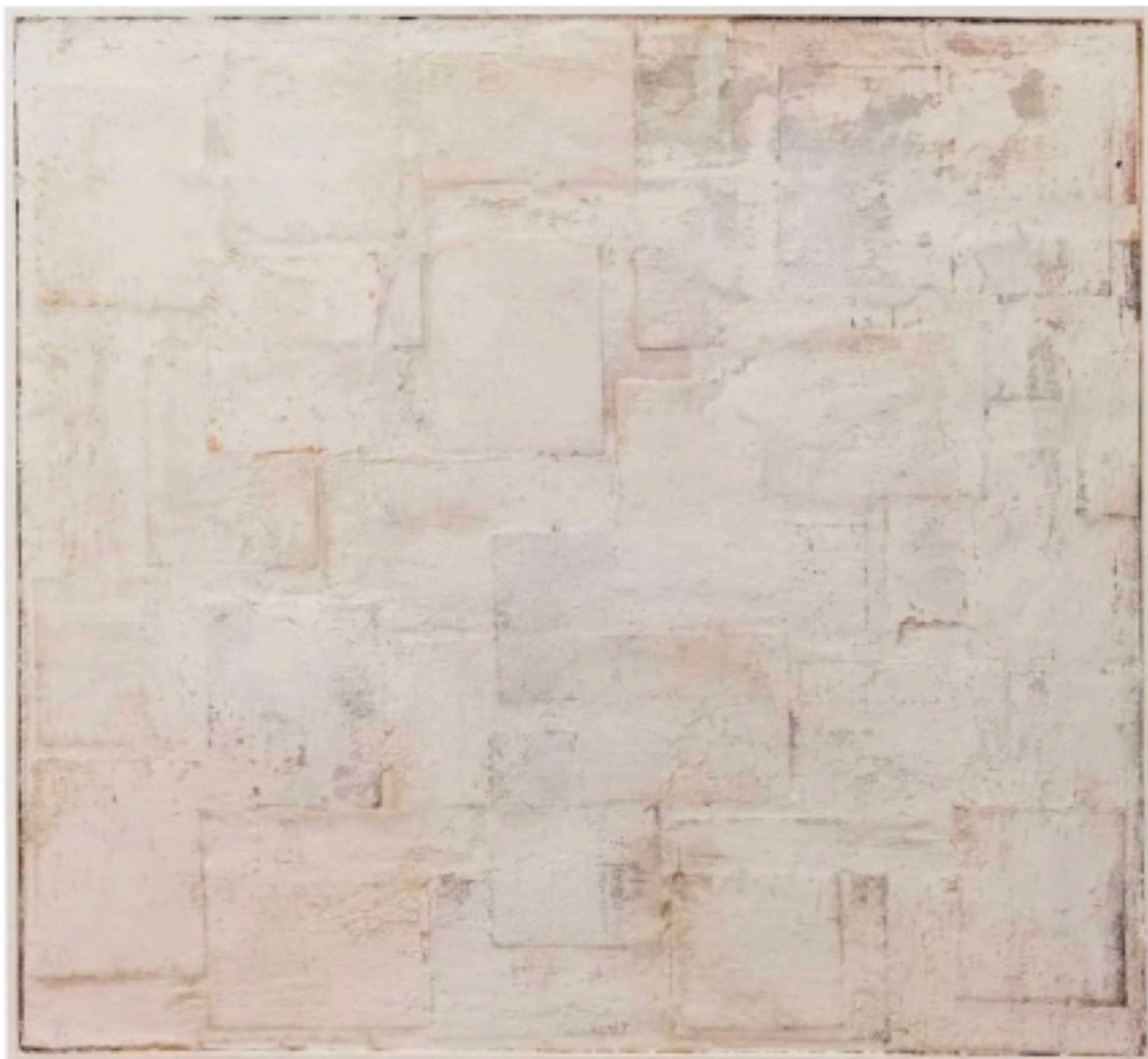
Incastri , Wooden base, colour catcher sheets, biolime, 75x70 cm